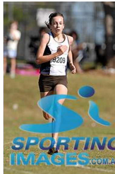
Eve – All Schools